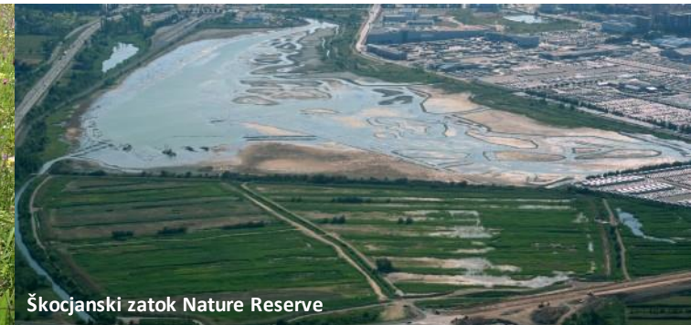
Škocjanski zatok Nature Reserve